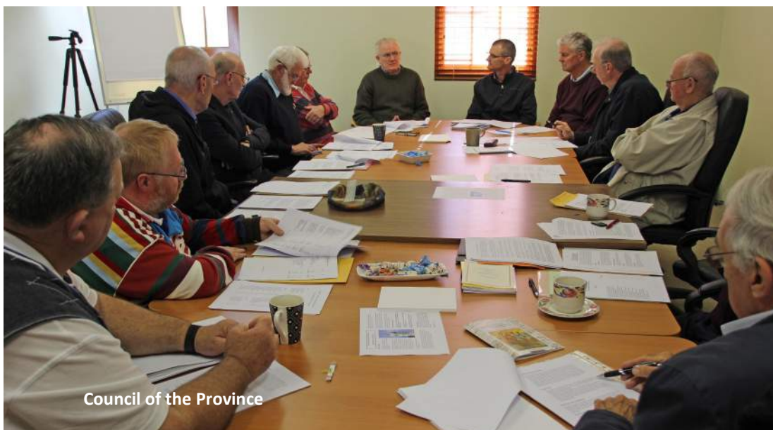
Council of the Province